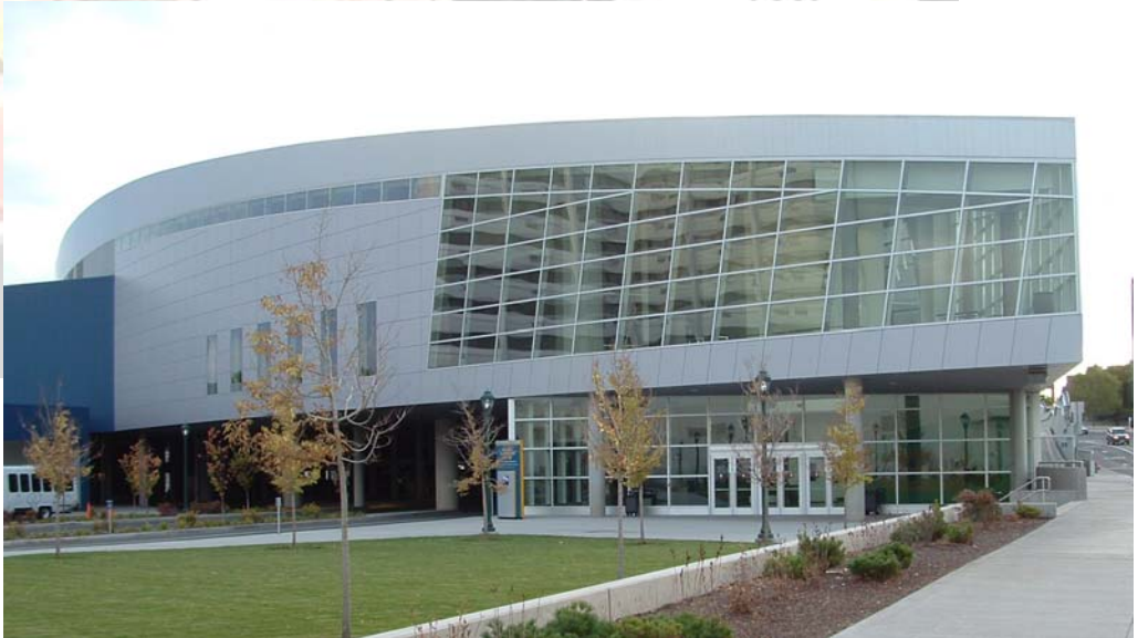
Spokane Convention Center